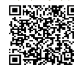
Vespers (Evening Prayer)