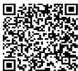
Readings at Mass