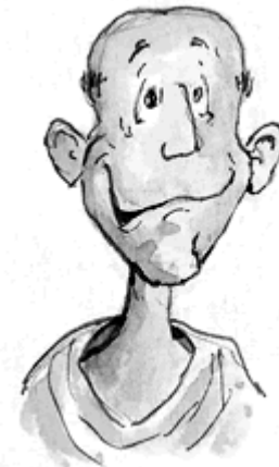
Zacchaeus