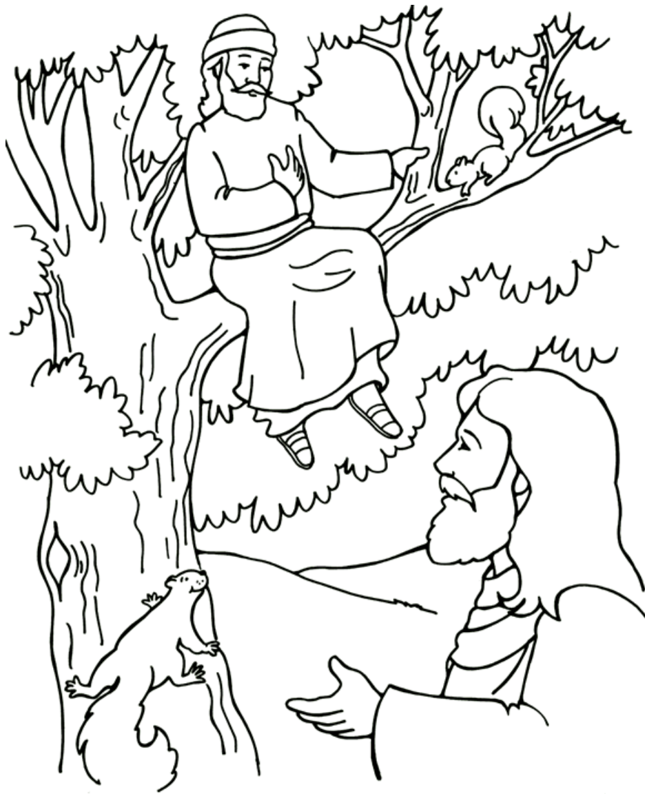
Jesus and Zacchaeus Luke 19

Each number represents a letter of the alphabet. Substitute the correct letter for the numbers to reveal the coded words.